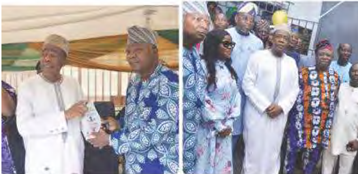
A collage of pictures showing the official opening of the Mushin general hospital by Senator Ganiyu Solomon

L agos State health officials and the management of Mushin General Hospital celebrated Senator Ganiyu Olanrewaju Solomon (GOS) for his significant contributions to healthcare in the community. The commendation came during the commissioning of the hospital's newly constructed Accident and Emergency (A&E) Unit.